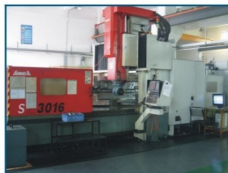
龙门加工中心 Bridge CNC