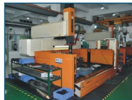
EDM成型设备 EDM Burning Machines