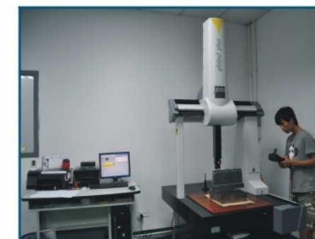
CMM三次元 CMM Equipment