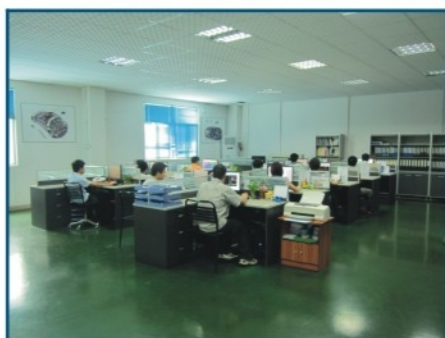
工程研发 R & D