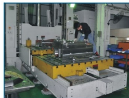
大型配模机 Die Spotting Press