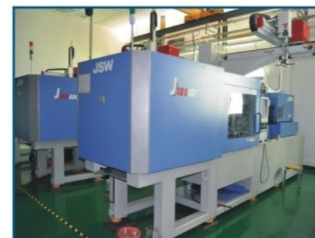
注塑成型设备 Injection Molding Presses