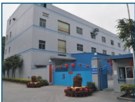
工厂外貌 Facility Profile